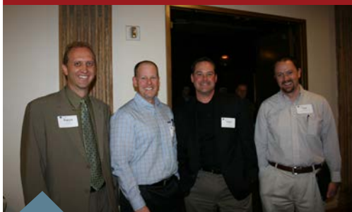
Visitors from the SMPS Colorado December Luncheon Program

Don't miss out on this professional development opportunity whether you want to network, meet up with your peers, hear what's critical in today's built environment, or want to address the business challenges faced by marketers, business developers, and practitioners in the AEC industry! For more information, visit the conference website at http://smpsswrc.org .